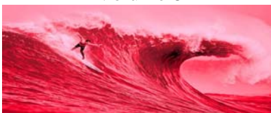
Ride the Red Wave !!!