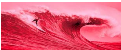
Ride the Red Wave !!!

In Charlotte, I was very active in Republican politics. I had not been active since moving to Carteret County. After retiring, one of my first endeavors was finding an activist group of women with the same values and work ethic that I have. It was soon very obvious to me that group was—and still is—the CCRW. This is the most fabulous group of women!! I joined and I am happy, happy, happy!